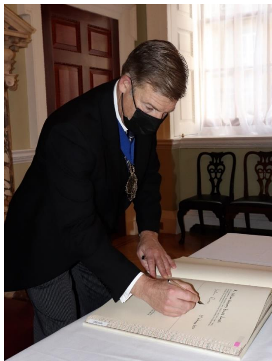
At Mansion House, the Lord Mayor signs his Statutory Declaration for a second term of office, in place of the usual Silent Ceremony.