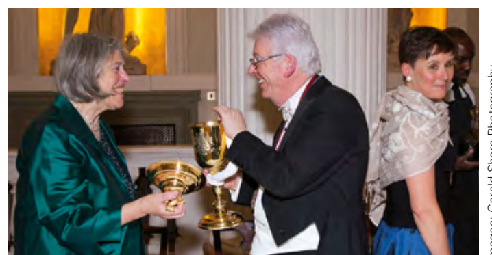
The Ceremony of the Loving Cup