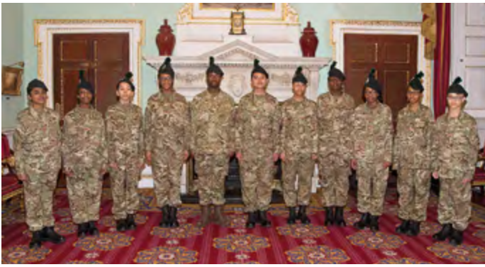
The Company's Cadets, the 71st Detachment of the London Irish Rifles